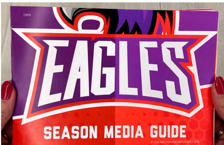
5 th Color Neon Pink toner blended with CMYK